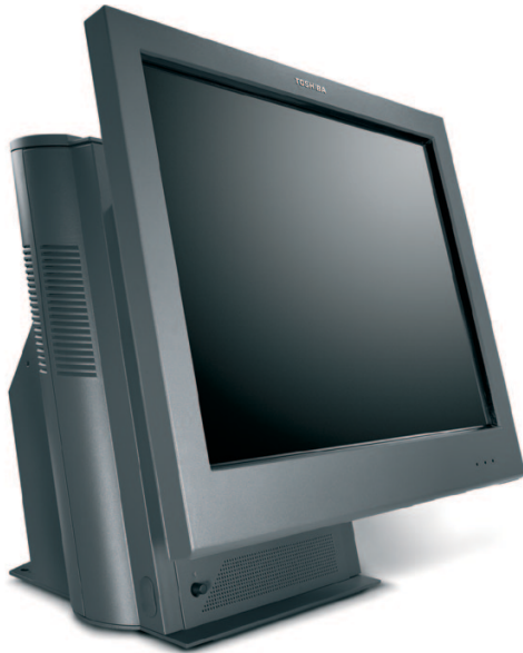
Shown: Toshiba SurePOS 500 Model 570