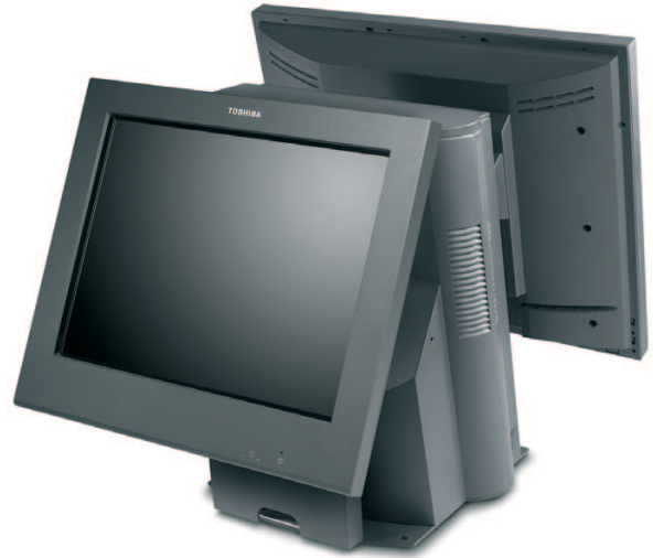
Shown: Independent customer display (12" display) delivers customer information and digital, multi-media merchandising (optional)